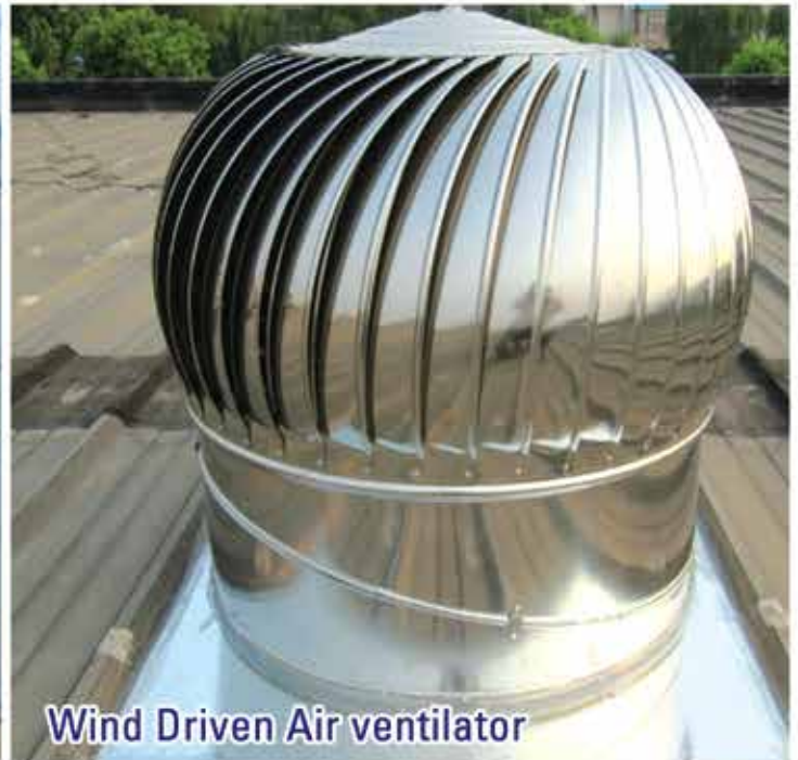
Wind Driven Air ventilator