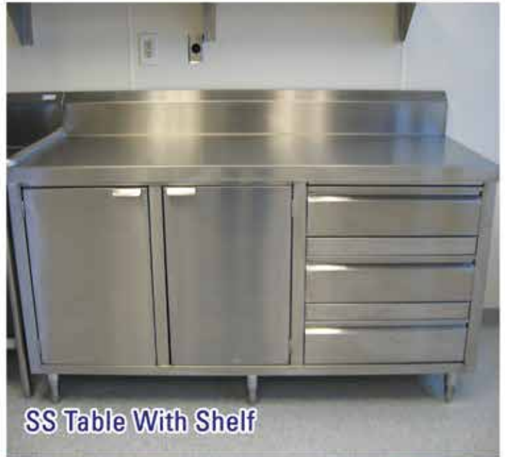
SS Table With Shelf