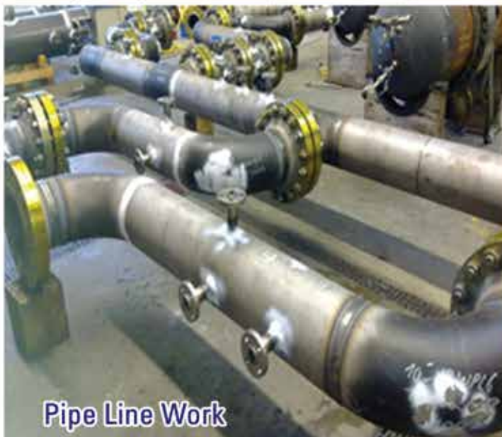
Pipe Line Work