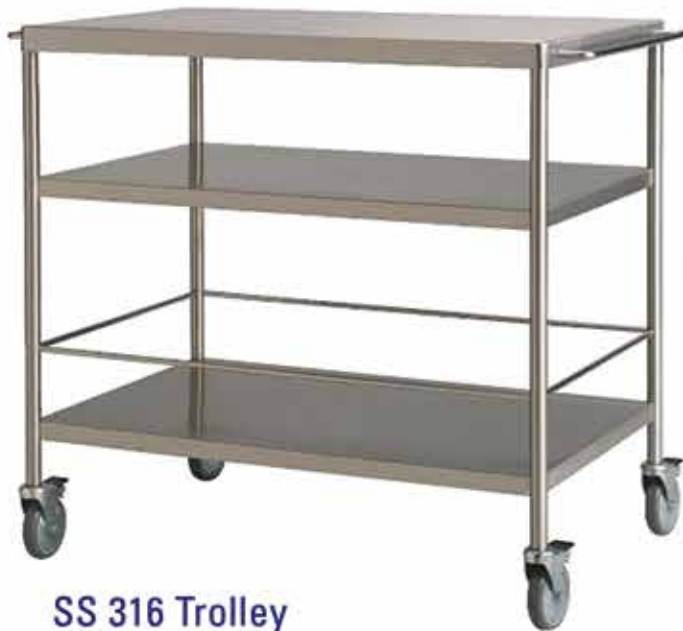
SS 316 Trolley