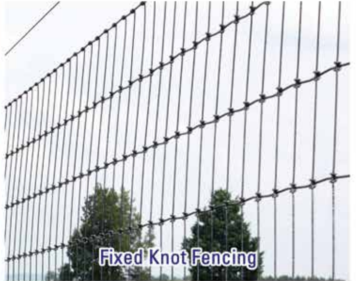
Fixed Knot Fencing