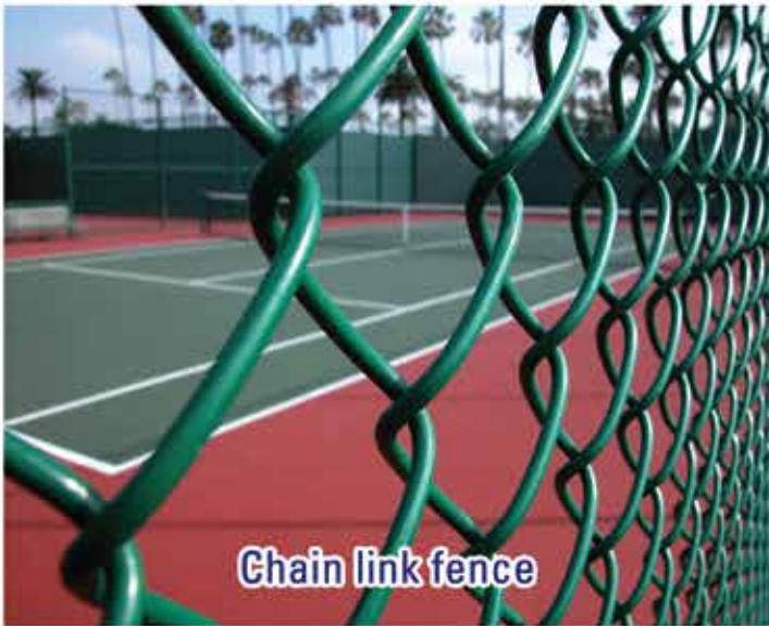
Chain link fence