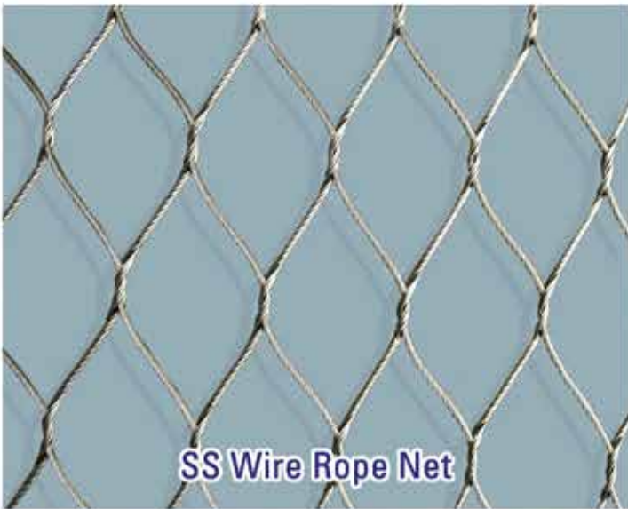
SS Wire Rope Net