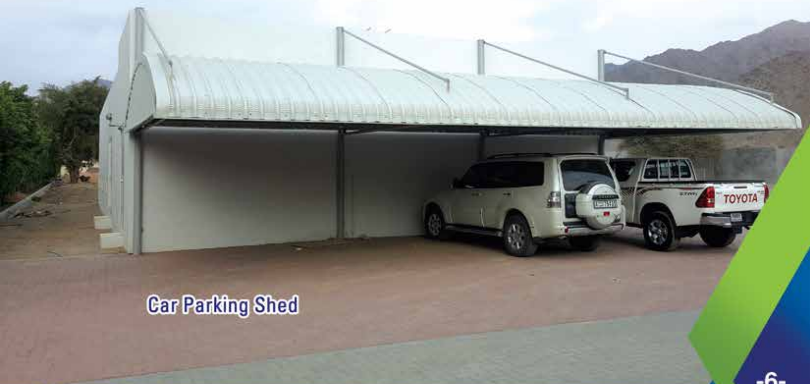
Car Parking Shed